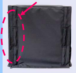
Strong magnet type (Available at clean room)

Set up Strong magnets Instead of Hook-and-loop fastener,