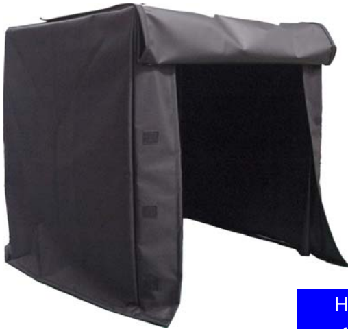
Hook-and-loop fastener type

Set up Strong magnets Instead of Hook-and-loop fastener,